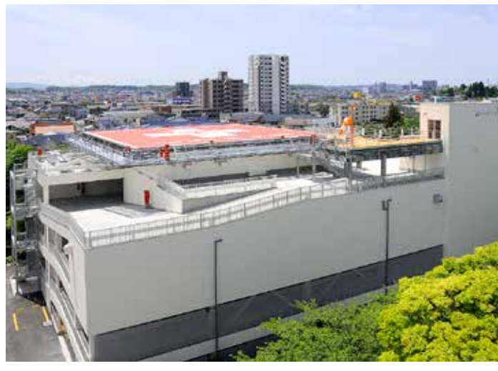
Helipad and Multistory parking lot